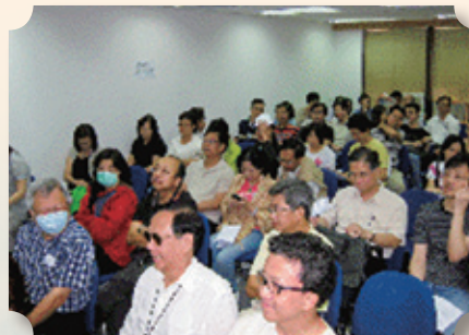
19/12 : “銷售人員的心理與輔導，以及 如何克服銷售的恐懼” "Psychology & Counselling of Sales person and how to overcome fear of selling"