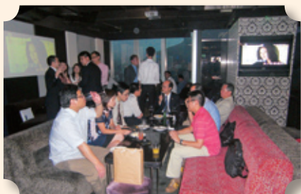
座無虛席，東京海上火災保險確有號召力 Packed, Tokio Marine does have appeal