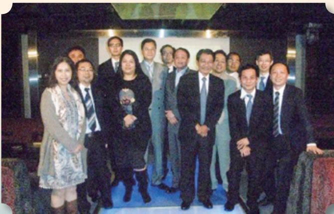
亞洲保險高層與HKCII理事合照 Asia Insurance executives and directors of HKCII