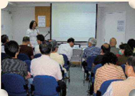
11/7 : “企業家精神 – 創意與創新” "Entrepreneurship - Creativity and Innovation"

HKCII在2009年主辦了2次持續專業進修課程 2 CPD courses organized by HKCII in 2009