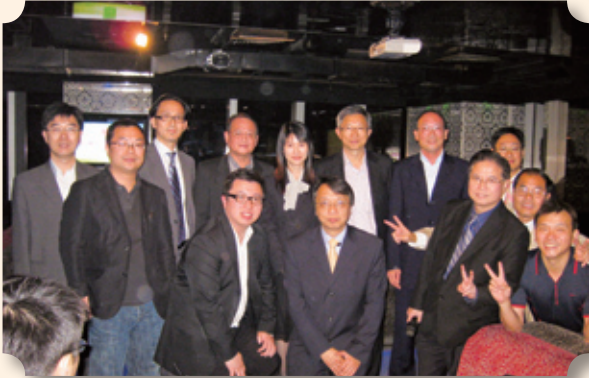
部份前會長與本屆理事合照 Some of the past presidents and current directors

由商會眾前會長主動提出贊助，他們愛商會、愛會員之情，打動了所有保險中介人商會會員的心。 Fellowship gathering sponsored by the past presidents, their love of the HKCII moved all members' hearts.