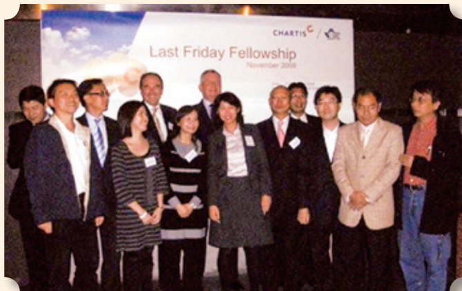
Chartis要員與HKCII理事們合照 Officers of Chartis and HKCII Executive Committee members

Each year AIU would sponsor HKCII Fellowship Gathering. Announced a new name Chartis in this gathering. Momentum getting vast !