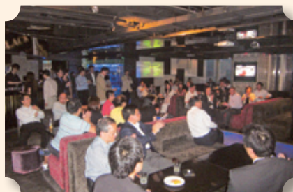
把酒言歡，一樂也 Wine made Fun