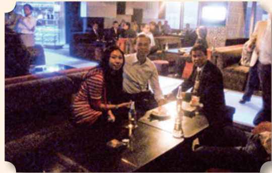
QBE每年都熱衷於贊助HKCII會員聚會 Every year, QBE supports HKCII Fellowship gathering