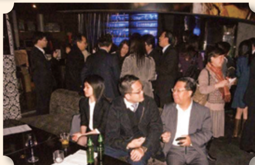
座無虛席 It's full house !