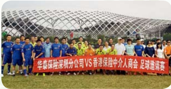
▲▶ 友誼賽 — 忠利保險（上左）、亞洲保險（上右）及深圳華泰保險（左）。

Friendly matches : Generali Insurance (upper left), Asia Insurance (upper right) and ShenZhen Hwa Tai Insurance (left).