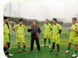
◀ HKCII 教練講解戰術。 Matching strategy by coach.