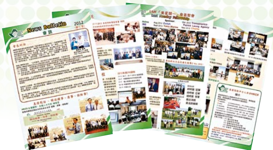
▲ 2012年度共出版了三期季刊。 Totally three Quarterly Bulletins were published.

將「會訊」和「年刊」的工作歸納為「出版事務」，更突顯商會的专业形象。前者一年出版數期，報導業界動向及會內外事務；後者一年一度除特設主題探討保險業相關市場發展及展望，更回顧本會過去一年的大小事務，並多謝大家各方面的支持以至年刊編輯小組的工作順利完成，樂哉！