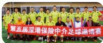
◀ HKCII 足球隊合照。 Football Team Members.