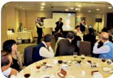
▲ 新一屆理事在1月11日舉行預備會議。 Preliminary Meeting on 11 Jan, 2012.