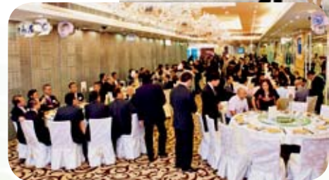
▲ 晚宴座無虛席。 Full House