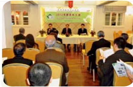
▲ 會議由會長、秘書長及財務長主持。 Meeting was hosted by President, Secretary & Treasurer.