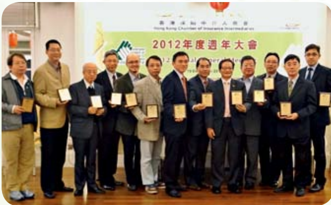
▲ 每位理事都獲頒服務紀念牌。 Service Trophies were awarded to every Committee members.