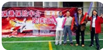
▲ HKCII 啦啦隊。 Cheering Squad.