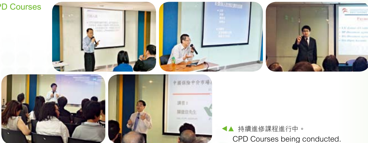
◀ 持續進修課程進行中。 CPD Courses being conducted.