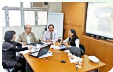
▲ 年刊編輯小組會議。 Meeting of Yearbook Editorial Board.