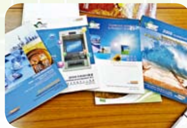
▲ 歷年會刊。 Past Yearbooks.