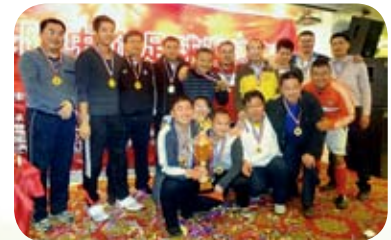
▲ 本屆冠軍 — 深圳保監隊。 Championship — CIRC Shenzhen.