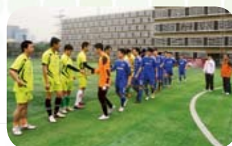
◀ 賽前握手，友誼第一。 Handshaking before competition.