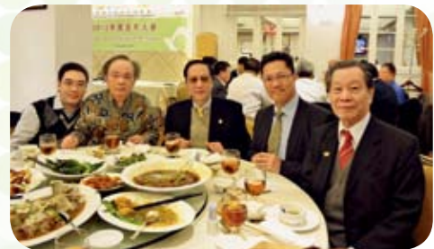
◀▲ 會後聚餐。 Dinner after Meeting.