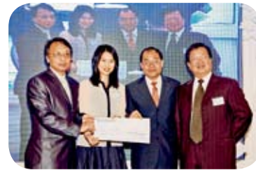
▲ 善款支票交予扶康會。 A donation cheque was presented To Fu Hong Society.