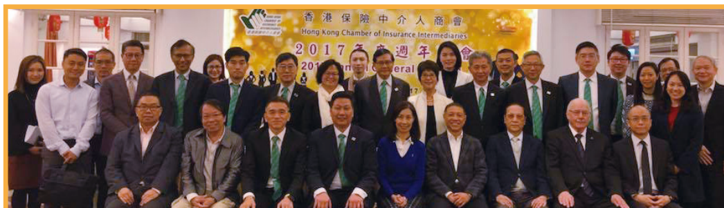
◆ 週年大會團體大合照 Grand Group Photo for all Honorable Guests and EC members, Past Presidents and Councilors