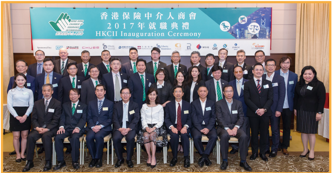
◆ 各屆前會長及現屆會長、理事與嘉賓合照 Group Photo with all honorable guests and EC members