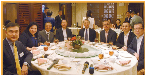
◆ 各友會代表一同出席午餐會 Industrial representatives join the Luncheon

Luncheon - Provision of HK Insurance Development