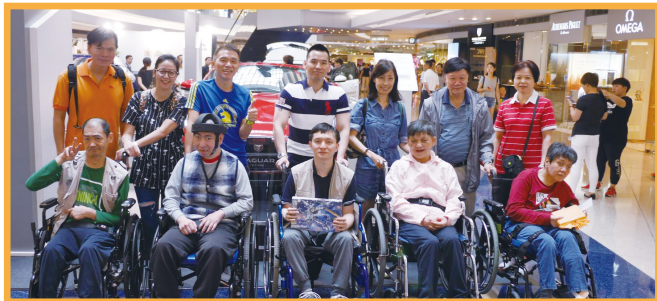
◆ 扶康會茶聚 - 各義工朋友與一眾朋友仔合照 HKCII participate in Fu Hong Society volunteer Best Buddies Activity. Carrying hostel dependences for an outing tour