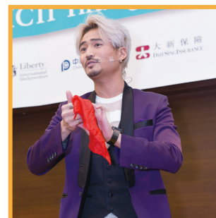
◆籌委會邀請到魔術明星 - Kelvin Siu作出特 別魔術表演 Magic show by Kelvin Siu - Entertainment Shows during the Inauguration Dinner