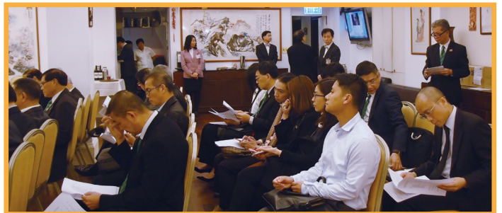
◆ 參與嘉賓，會員，全神貫注，認真關注一年的工作報告 Honorable Guests and attending members are concentrating on the AGM presentation