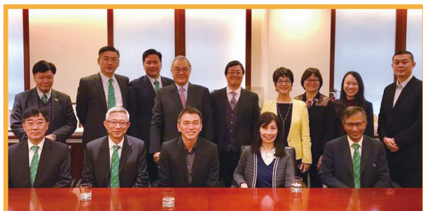
◆ 拜訪時任保監局主席鄭慕智博士GBS, JP，共商業界關心議題 Executive Broad of HKCII courtesy visit with IA Chairman Dr. Moses Cheng to exchange the intermediaries concern on new IA regulation