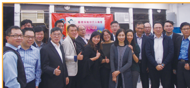
◆ 2017蛇宴座無虛席 2017 Snake Meal Banquet is full house