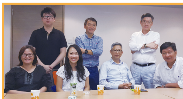
◆ 會議討論如常滔滔不絕，但意見不一，才會作出好結論 Although we have different approaches on issues, we all are making a better Chamber