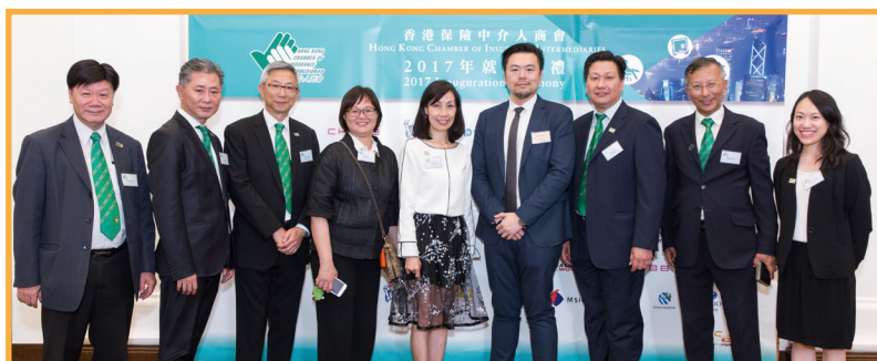
◆來賓合照 Group Photo with the guests