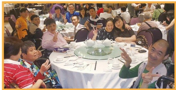
◆ 扶康會學員非常開心，與我們一同享受美點 The hostel dependences enjoy the experience for dining out with the volunteers