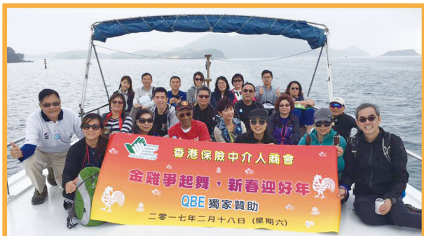
◆ 乘風破浪 Tracing of the wind