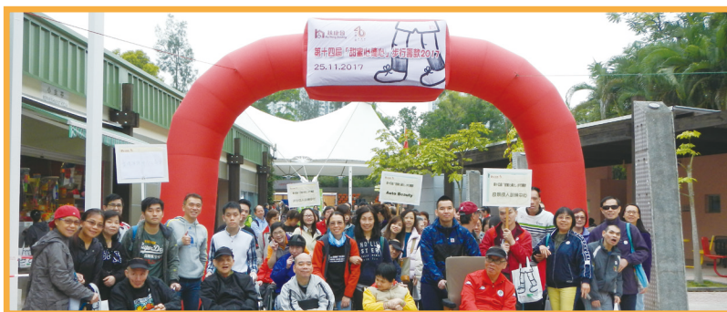
◆ 活動於大埔海濱公園舉行 Charity Walkathon Group Photo at the starting points in Tai Po Waterfront Park