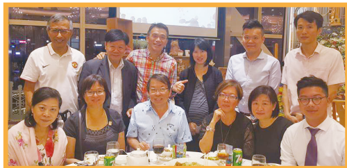
◆ 本會贊助兩圍酒席 HKCII reserves two tables to appreciate participating volunteers over the year