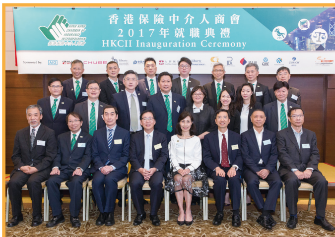
◆ 各屆前會長及理事與嘉賓合照 Group Photo with all past Presidents and 2017 EC members