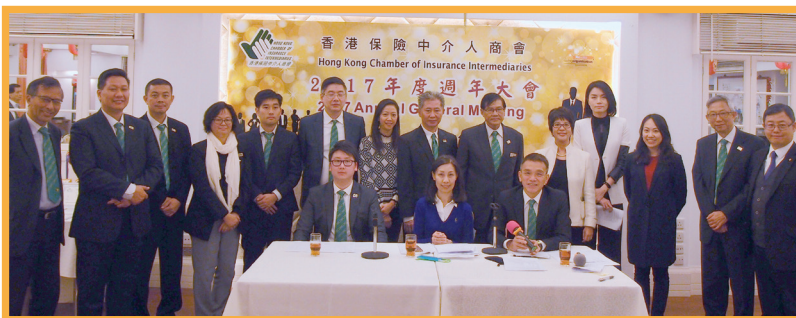
◆ 週年大會的議程順利通過，大家來個大合照 Group Photo after the AGM event