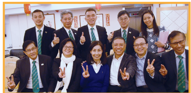
◆ 順利完成整年的工作，從笑容可見大家有多開心 Mission completed! EC members are appreciated with their achievement