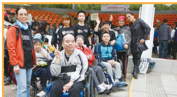
◆ 扶康會學員再次見到我們很開心呢 Fu Hong's long last friends with HKCII