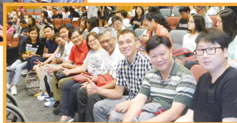
◆ 參與畢業典禮前理事大合照 HKCII Volunteers attend Fu Hong Society 2017 Best Buddy Convocation