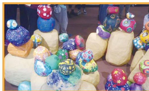
◆ 扶康會學員之作品 Art creations from Fu Hong hostel dependences