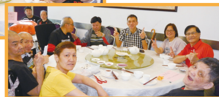
◆ 典禮後與扶康會會員共進午餐 Appreciation Lunch after the Convocation Ceremony