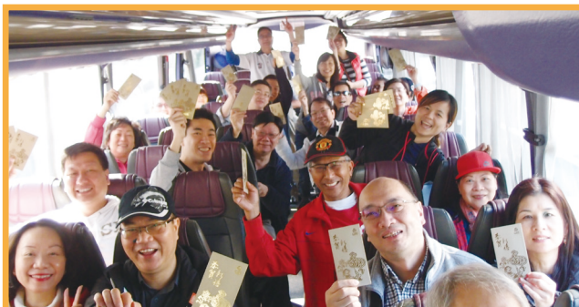
◆ 贊助商增設抽獎節目 Lucky draw arranged by QBE