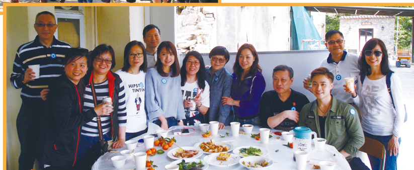
◆ 鹽田仔享用農家菜午餐 Enjoy the Country Style Lunch in one of the oldest village at Yim Tin Tsai in Hong Kong