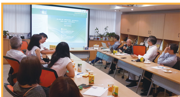
◆ 在每月的例會，理事們都會為會務盡我所能，提出意見，務求達到最佳成效，這次會議主要項目是提升商會網頁效能 Chamber monthly meeting for effective operation