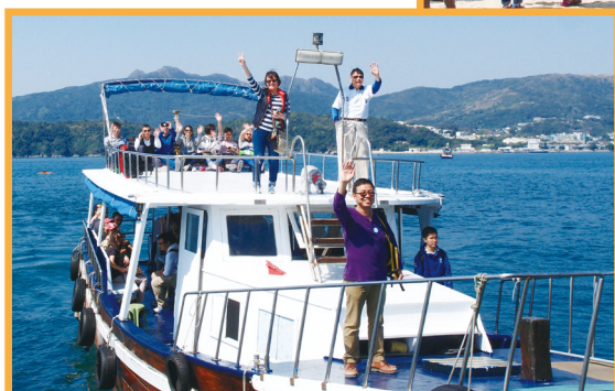
◆ 真正遊山玩水 A real experience on land and sea tour