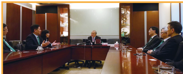
◆ 會員坦誠與鄭博士GBS, JP討論保險業監管局新規範 Committee members voice out the concern and expectation of new IA & regulation regime