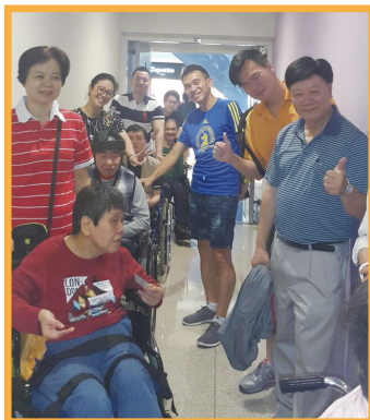
◆ 活動結束後大家齊齊等車離開 Participants patiently wait for the transportation arrangement to return hostel