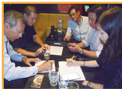
◆ 會議進行中 Meeting in progress