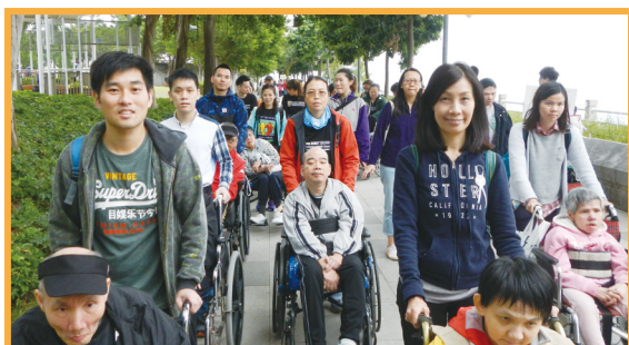
◆ 本會多名會員一起參與一年一度甜蜜心連心步行籌款活動 HKCII participates in 2017 Fu Hong Society Charity Walkathon