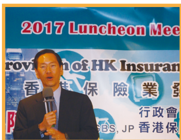
◆ 行政會議召集人，陳智思GBS, JP, 分享議會內點滴及內地發展動向，勉勵會眾找緊發展機遇 Bernard shares interesting stories in EXCO and reveals direction of the HK & Mainland development. HKCII members are encouraged to put more effect to cope with the economic blooming from HK/Mainland development