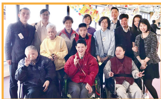
◆ 本會會員與扶康會學員一同參與 HKCII attends the Fu Hong Art Showcase