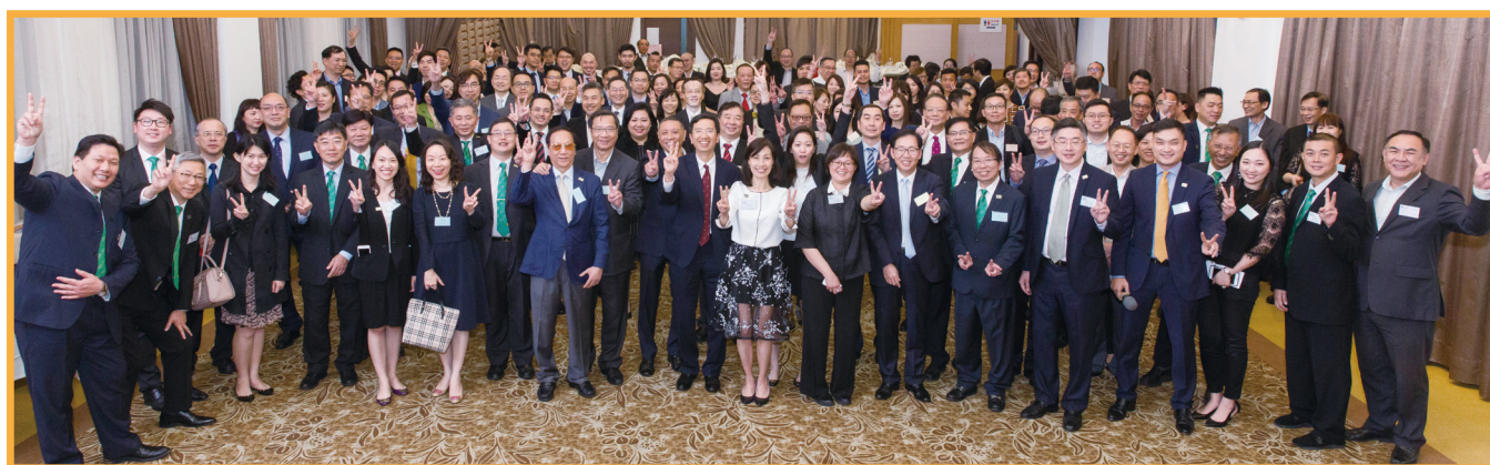
◆ 出席嘉賓及理事大合照 Grand Group Photo with all attending guests